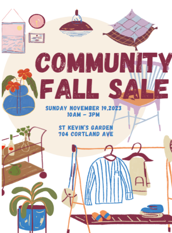
Venta Comunitaria de Otoño

Estamos felices de informarles que después de varios meses de formación y duro trabajo ya tenemos un plan para el futuro de nuestra parroquia. Los detalles serán publicados y compartidos pronto.