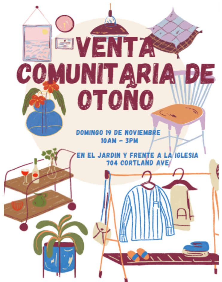
Community Fall Sale

Todos los fondos recaudados irán en beneficio a las obras de la Iglesia. Si esta interesado en donar algo por favor comuníquese con la oficina parroquial.